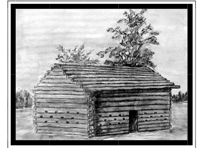
Fort built about 1826 in Section 26, Industry Township, McDonough County

Researchers may use the collection in our facility. Our society also offers research services by mail. For details and fees, please contact us for additional information or visit our web site.