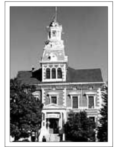
McDonough County Courthouse